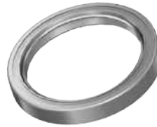
3x - Ø40mm Seal (1) will be used for Output Seal