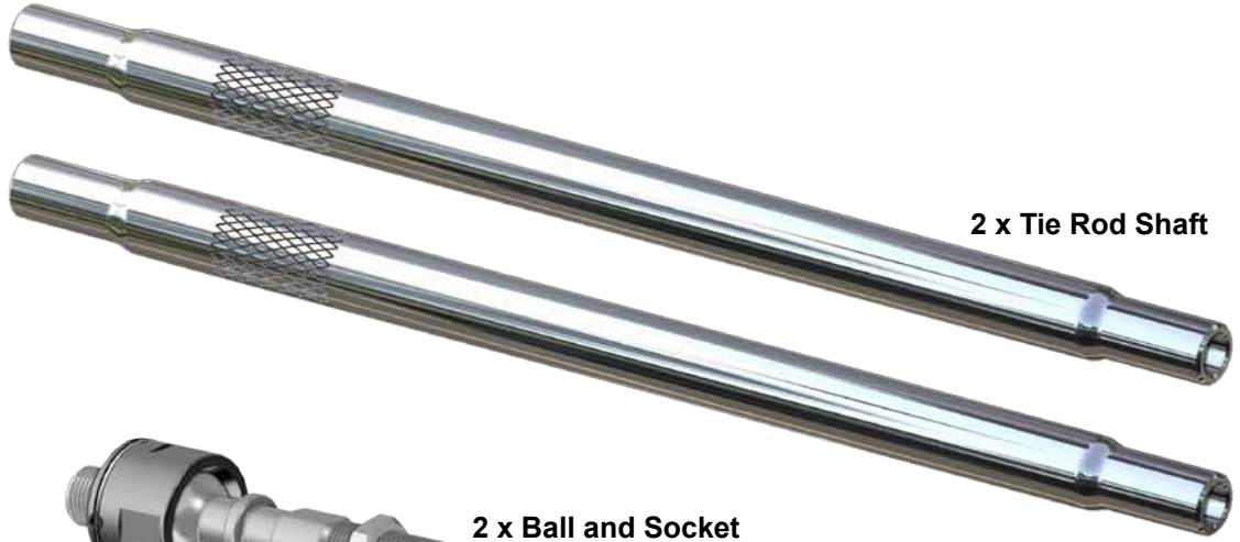
2 x Tie Rod Shaft