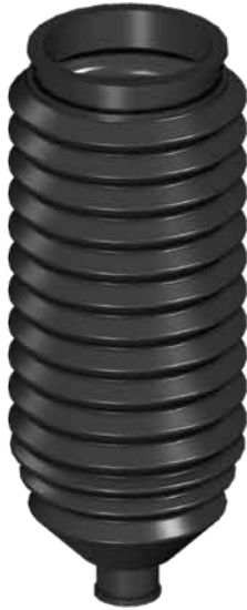
2 x Large Boot