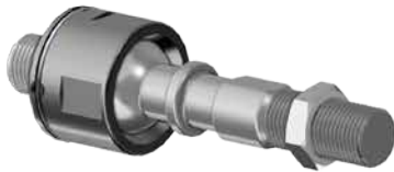
2 x Ball and Socket