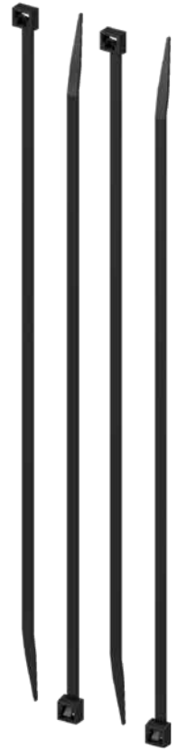
4 x Zip Tie