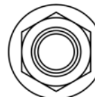
M8-1.25 x 25mm Lg. FHCS