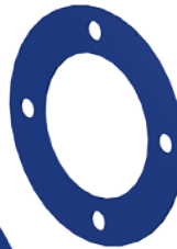
Cap Gasket (GEN1 and 2)