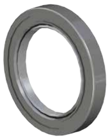
Ø35mm Input Seal

Kit includes similar components. Remove originals and compare to new; install correct match.