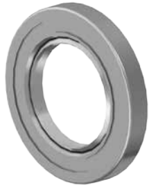
Ø30mm Input Seal