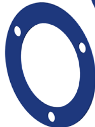
Cap Gasket (GEN3)