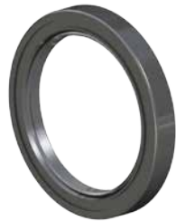
Ø35mm Output Seal